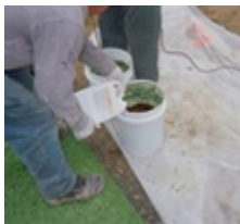
Installation Step Two

This picture shows the two components that make up our proprietary STA-1000 synthetic turf adhesive. One unit of STA-1000 contains a 5-gallon bucket of part A and a 1-gallon jug of Part B. The two componenets will be combined to create the strongest turf bonding agent on the market.