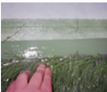
Installation Step Nine

This is a picture of our artificial turf seaming technique. It is only necessary to fold back one piece of carpet. Be sure to fold over the side where the fibers of the turf lay into the seam. Consequently, the side that the fibers are pulling away from the seam should be left on the base.