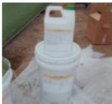
Installation Step One

This section contains instructions and pictorals for installing artificial turf with our revolutionary STA-1000 synthetic turf adhesive. Our system utilizes a custom two-component glue for optimal durability and versatility.