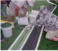
Installation Step Seven

This is another view of our gluing operation. Note the 3" thick bead of artificial turf adhesive running down the center of the tape. Installation companies typically make the mistake of putting a thin amount of glue across the entire width of the seaming tape. Synthetic turf seams that are on flat surfaces are not under a tensional load and do not need adhesive 5" into the carpet; they need the adhesive on the critical area, which is the seam itself.