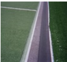
Installation Step Ten

Slide the seaming tape under the side of carpet that is laying down. Set the seam so that the seaming tape and turf adhesive are centered on the seam. Glue bead should be thick enough to mushroom up and over the 1st 1/4" of the topside of your artificial turf. This will not trap fibers but it will create a moisture barrier for your seam.